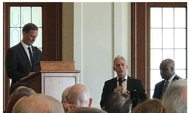
Rep Trey Gowdy speaking at the Security Summit

The theme for the day was the changing national security posture and threats and the need for a strong military on land, sea, air, and especially cyber.