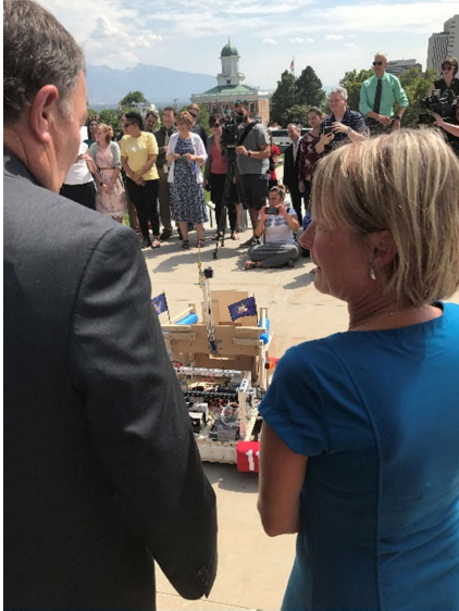
Gov Herbert and STEM AC Dir Tami Goetz

The Utah STEM Bus (USB) will travel to schools across the state to provide students with hands-on learning to promote interest in STEM careers. The USB is funded by a $1.5M grant from Tesoro and is modeled after similar STEM buses across the nation.