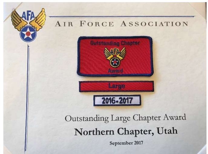
Chapter 235 Outstanding Large Chapter Award