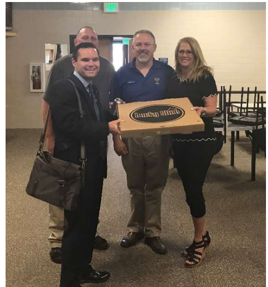
State convention attendees sharing pizza from AFA Community Partner Lucky Slice Pizza