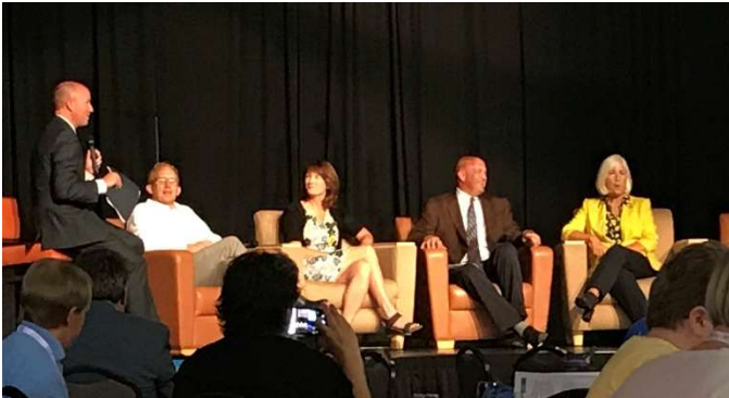
LtGov Spencer Cox, left, with industry/education panel

motivate students in grades K-12. With record attendance at over 600, it was a high energy event that really served to get attendees excited about teaching STEM! The highlight of the day was a panel hosted by Utah LtGov Spencer Cox where he interacted with industry and education representatives on STEM workforce needs and opportunities for improvement.