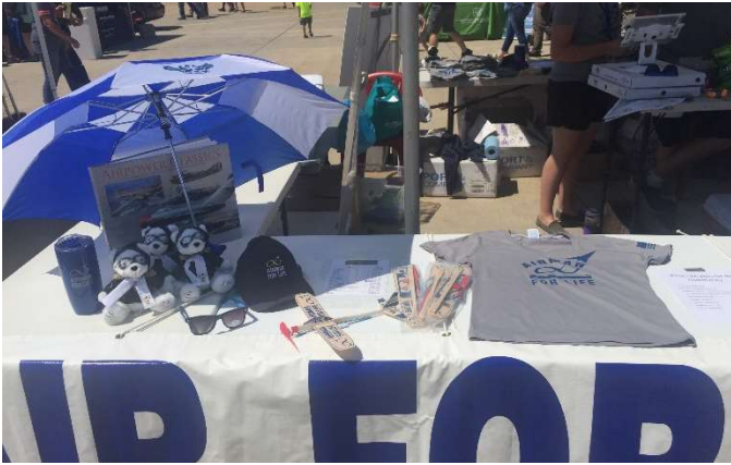
AFA logo merchandise